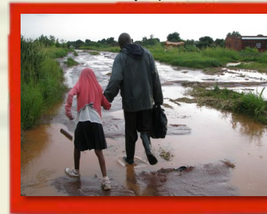
Walking home from school during the rainy season!